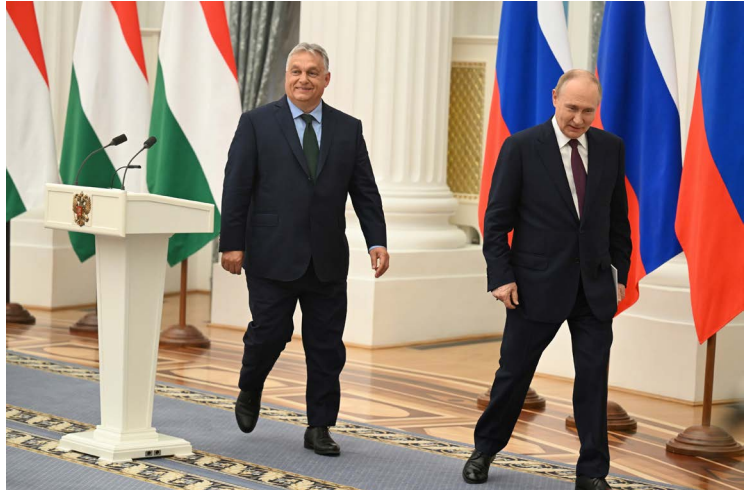
Russian President Vladimir Putin and Hungarian Prime Minister Viktor Orbán meet at the Kremlin, May 7, 2024, in Moscow, Russia.

Meanwhile, Hungarian Prime Minister Viktor Orbán met with U.S. President Donald Trump to request an exemption from U.S. sanctions following the administration's decision to target Russian energy companies Rosneft and Lukoil. Shortly following the meeting, a waiver was granted for Hungary by the U.S. government to purchase Russian oil. Russia has used its energy muscle to pressure and court Bulgaria for its support for Ukraine; keep Serbia and Bosnia and Herzegovina in its political orbit; lure Turkey into strategic ambiguity ; and even manipulate Germany into complicity.