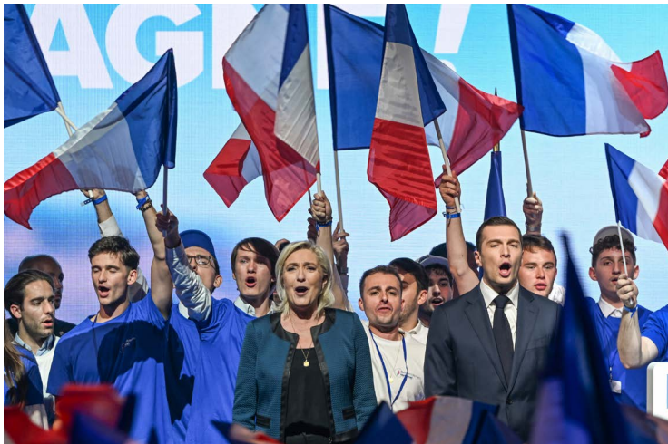
Marine Le Pen, former president of the National Rally party, with Jordan Bardella, current president of the National Rally, a French nationalist and right-wing populist party, photographed during a pre-European Parliament election, June 2, 2024, in Paris, France.

In 2024, an investigation by EU intelligence agencies revealed that Voice of Europe, a Russia-backed eurosceptic media outlet with ties to Ukrainian oligarch Viktor Medvedchuk, who named Putin as the godfather to his daughter, was behind a series of payments to European Parliament members. The investigation's findings state that the list of target countries included Belgium, France, Germany,