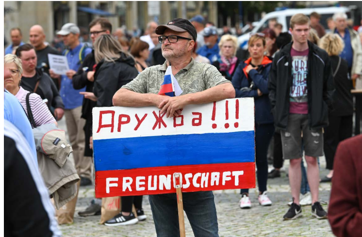
July 1, 2023, Saxony-Anhalt, Magdeburg: A participant of the AfD rally holds a sign in the colors of Russia with the German-Russian inscription "Druzhba!!! - Friendship." At the rally, AfD state and federal politicians criticized the EU and called for change.

Hungary, the Netherlands, and Poland. Payments were facilitated through cash and cryptocurrency exchanges, with meetings held in Prague, Czechia. The network was part of a larger system designed to entice European politicians to undermine Ukraine's territorial integrity and independence.