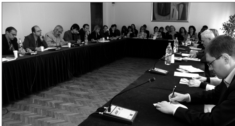
During the workshop on the first year of operation of local public mediators in Bulgaria