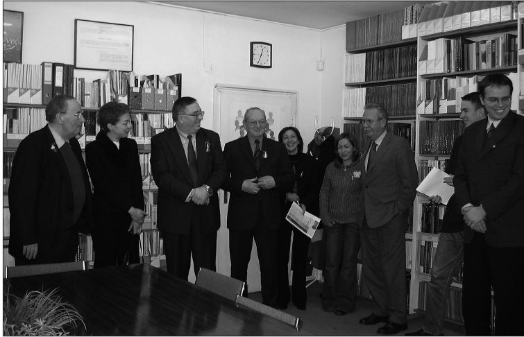
The Parliamentary Commissioner for the Armed Forces of the German Bundestag Dr. Penner meets CSD representatives

In order to encourage domestic debate, CSD's Law Program hosted a public discussion on the two Draft Laws on the Patients' Rights and Obligations , submitted to the 40th National Assembly (October 11, 2005). The event brought together experts at the Parliamentary Human Rights and Religious Affairs Committee, representatives of the par-